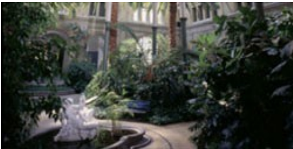
Part of the Winter garden

The Ny Carlsberg Glyptotek is an art museum of international stature situated in central Copenhagen. Founded in 1888 by brewer Carl Jacobsen (1842-1914), it holds rich and diverse collections in its two main collections – one devoted to ancient art of the Mediterranean area, the other to French and Danish art of the 19 th and 20 th century.