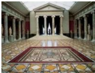
The Central Hall at the Glyptotek

- “Being Danes, we know more about flowers than about art ... and I imagine that during the winter, this greenery will make people pay a visit; and then, looking at the palms, they might find a moment also for the statues”. ... said the founder in 1906, and, indeed, people still do!