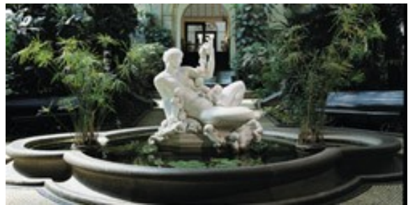
The Water Mother in the center of the Winter Garden

As intended by the founder, the Ny Carlsberg Glyptotek is a museum of beauty all its own. In the Winter Garden visitors relax in a setting of subtropical evergreens under the huge glass dome of the Garden.